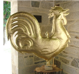
Photos: Arch Randolph & Drew Colby removing the rooster. Before and after restoration work.