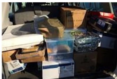
The church van packed and ready to go