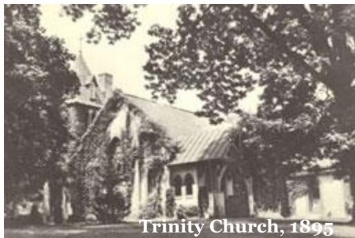
Trinity Church, 1895