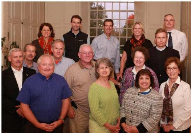
2014-2015 Trinity Episcopal Church Vestry

Little known facts about Trinity Episcopal Church – Upperville, VA