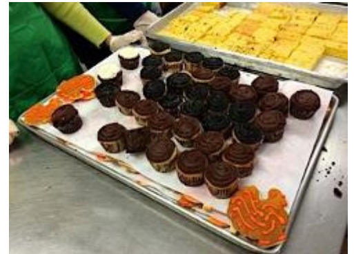
Sweet treats baked for the folks at SOME

*As always, donations of cookies, cakes, muffins, breads, and brownies are always needed. Mark items for "SOME" and leave in Cox Hall on the designated date.