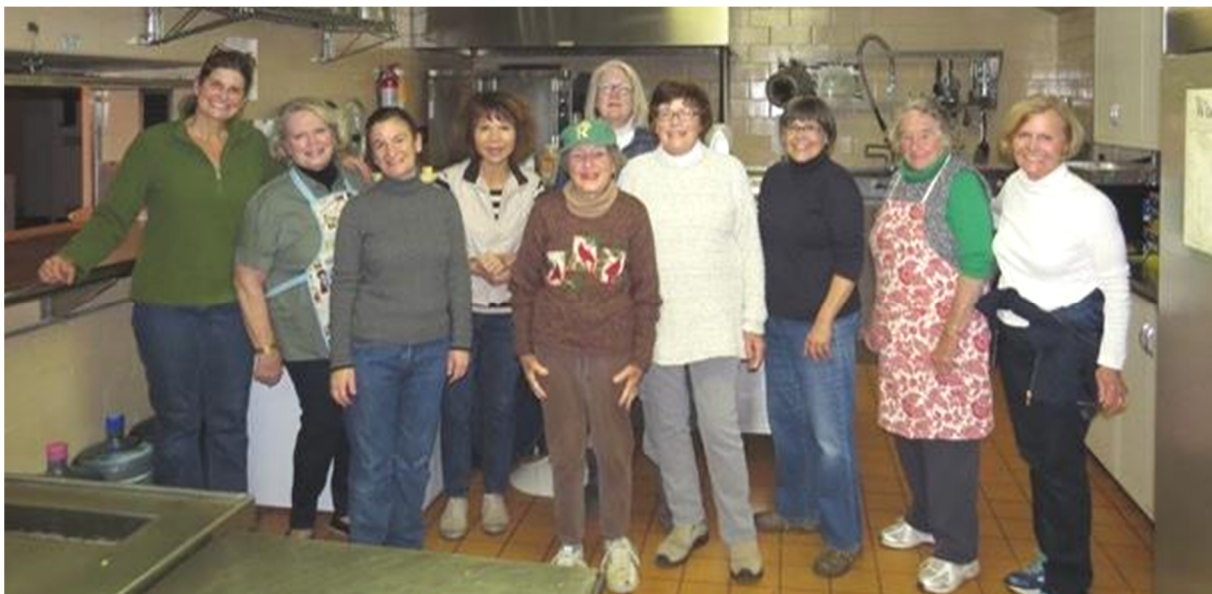
These are "SOME" cooks! Thank you all.