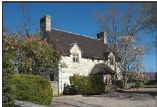
The Peard House (church office)

Little known facts about Trinity Episcopal Church – Upperville, VA