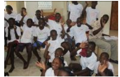
Outreach funds for $6000 approved