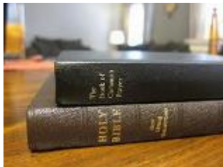
Click on the image to download the pdf file, "Read the Bible in a Year" plan from The Center for Biblical Studies. This document along with The Book of Common Prayer are available on our website: www.trinityuppperville.org/Resources

Morning, Noontime, and Evening Prayer as found in our Book of Common Prayer. There are simplified versions intended for individuals and families beginning on page 136. I commend them to you.