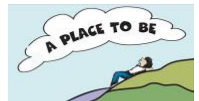
A Place to Be funded by Outreach, $1500

Outreach funds were also approved for 2014 ESL $4800 The Churches of Upperville $1500