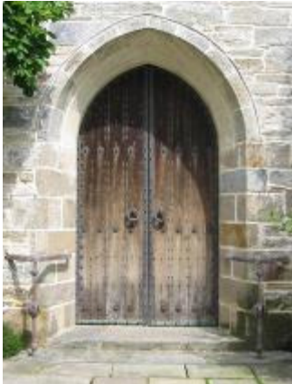
Pomegranates shown at each side of our doors.