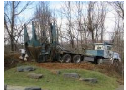
Mature Maple Tree being planted