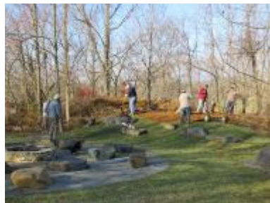
Dogwood trees being planted by hand

The Outdoor Sanctuary received the gifts of trees and shrubs which were installed last month during a mild December. According to arborist Philip Klene of Shade Tree Farm, the conditions were perfect to receive these living gifts, planted in memory, honor, and thanksgiving of loved ones.