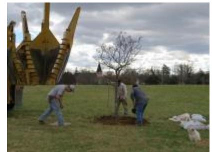
Sourwood tree for shade