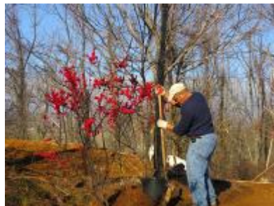
Winterberries provide food for the birds