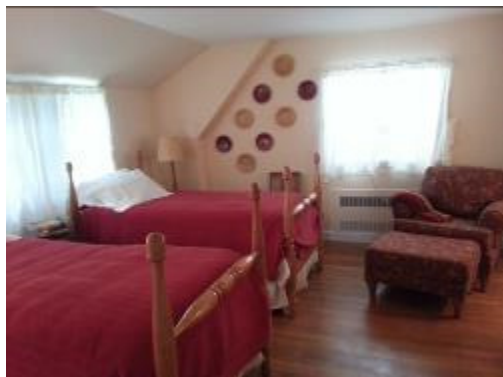
Bishop's Quarters Bedroom