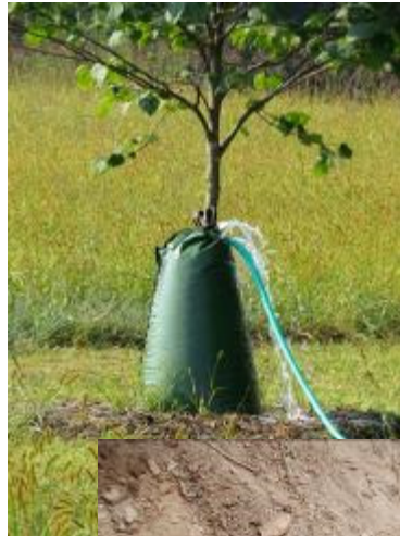
At left, a tree being watered at the Outdoor Chapel. Below, Matt (left) of Plumbtech and his assistant working on replacing the main water line to the Peard House. Broken windows were replaced in the Gullick House, along with the neutralizer system, and a plumbing leak repair in the upstairs bathroom was handled. These are just a few of the items requiring repairs this summer.